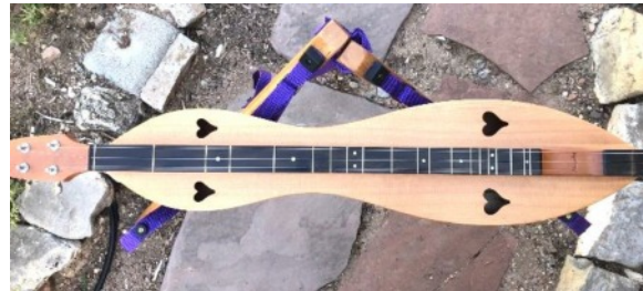
Straps are too long which may allow dulcimer to slide away from you slightly as you play