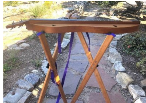
Straps are properly adjusted and dulcimer is secure and level