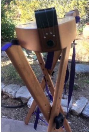
Straps are too short causing dulcimer to tilt toward you