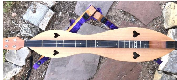
Straps are too long which may allow dulcimer to slide away from you slightly as you play