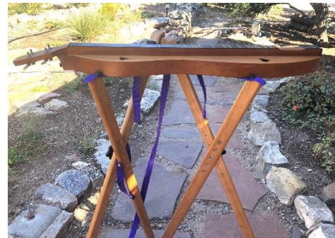
Straps are properly adjusted and dulcimer is secure and level