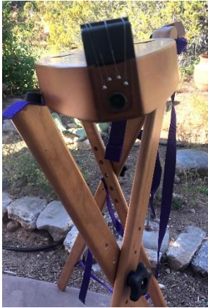
Straps are too short causing dulcimer to tilt toward you